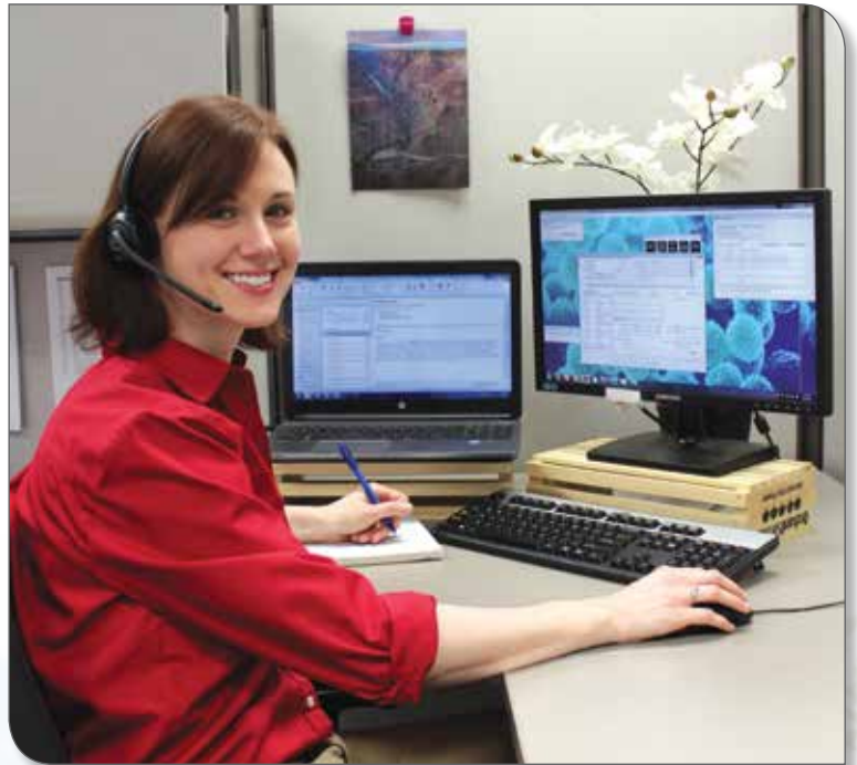
Orchard's support package provides friendly 24/7/365 telephone technical support and the ability to submit support tickets online.

With more than 25 years of LIS experience, Orchard's commitment to and focus on the laboratory has not wavered. The scalability and flexibility of Orchard's laboratory information systems facilitate a high level of configurability that enables Orchard to support a diverse client base. Since our first installation in 1993, more than 1,500 laboratories across the country have turned to Orchard Software. Our success and breadth of expertise is our testimony to our lab focus and our ability to deliver advanced laboratory software solutions.