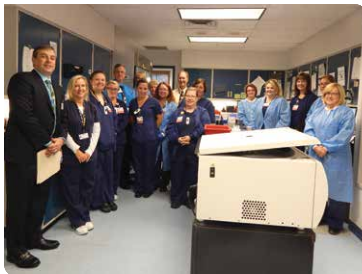
The WHS lab staff (pictured above) and Orchard Software team continue to collaborate to maximize the value of Orchard’s products.

Its main laboratory performs approximately 1.9 million tests per year with a staff of 95, and the WHS-Greene location has an annual volume of about 160,000 tests with 15 laboratory employees. The WHS laboratory has taken Orchard’s systems