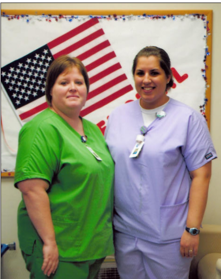
Staff from Graves Gilbert's satellite location.

As COO, Craig thinks their attendance at Orchard’s training classes has made some of the most significant changes to the laboratory. “It seems that every time they come back from a training class that they have something new to implement to improve lab work flow and share with the rest of the team. The training courses are time well spent.” ●