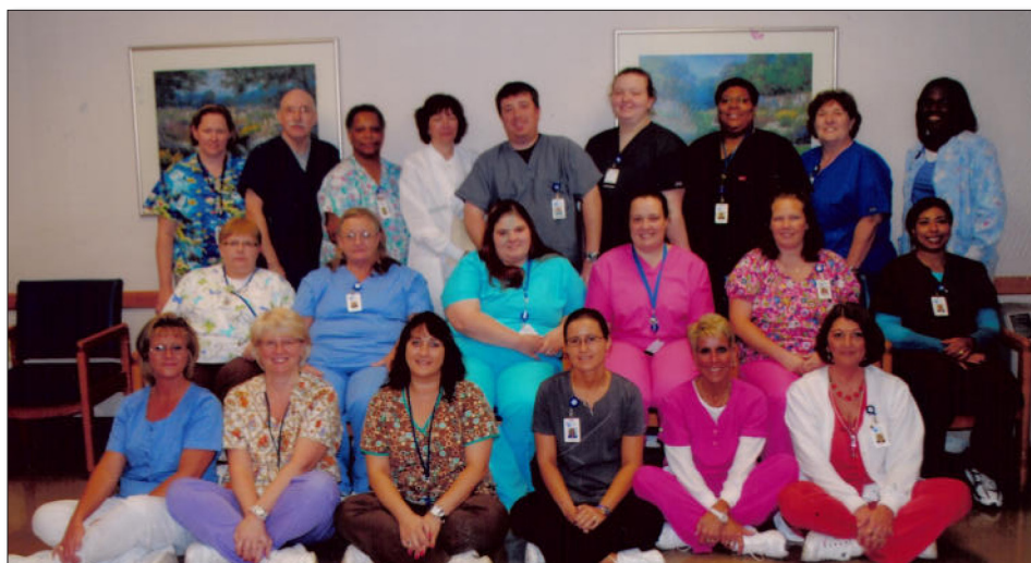
The lab staff at Graves Gilbert Clinic's main location in Bowling Green, Kentucky.

Graves Gilbert Clinic, located in Bowling Green, Kentucky, started in 1937 as a physician-owned multi-specialty clinic and remains that way to this day. The team agrees that “We are truly a family at Graves Gilbert. We are dedicated to each other and are not only co-workers, but also friends.” The lab is open six days a week, Monday through Saturday, and performs around 1,000 orders a day, including all in-house, reference lab, and waived testing. The clinic serves a populated area of around 300,000 in what recently became the third largest city in Kentucky.