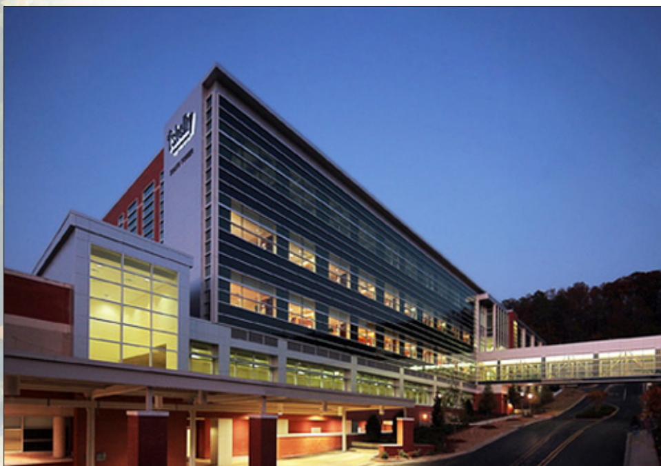
Baptist Health System's Shelby Baptist Medical Center showcasing its South Tower at dusk.